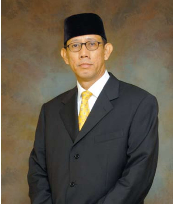
Yang Mulia Dato Paduka Haji Mustappa bin Haji Sirat